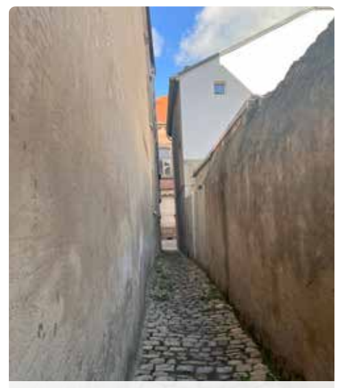
Typical Schloff - Kellereigank

b TIP: You can also reach the next point, Rue de la Sûre, via the low barrier path that runs straight ahead from Wollefstuerm through Rue des Redoutes.