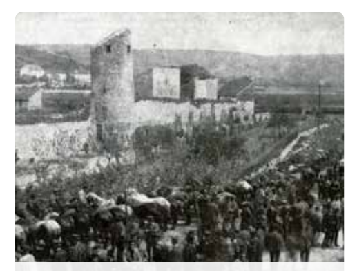
Regional horse market at the Trier Gate

For many years, an important regional horse market was held on the square next to the Trier Gate .