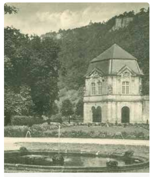
Rococo pavilion & limestone tuff fountain

sources that ran through the gardens of Echternach's former monastery during the abbev period. The stone in the middle is a limestone tuff, the voungest solid rock in the Müllerthal region. In the surrounding sandstone, the lime is dissolved. which forms the binding agent between the quartz grains. If this lime-rich water comes to the surface from a source, solid lime can form again through evaporation of the water and other processes. The calcareous water that spouts from the stone means that the stone continues to grow to this day. The moss that has settled on the stone is called curled hook-moss. It grows in calcareous and moist locations and likes to colonise soil, rock and rotten wood.