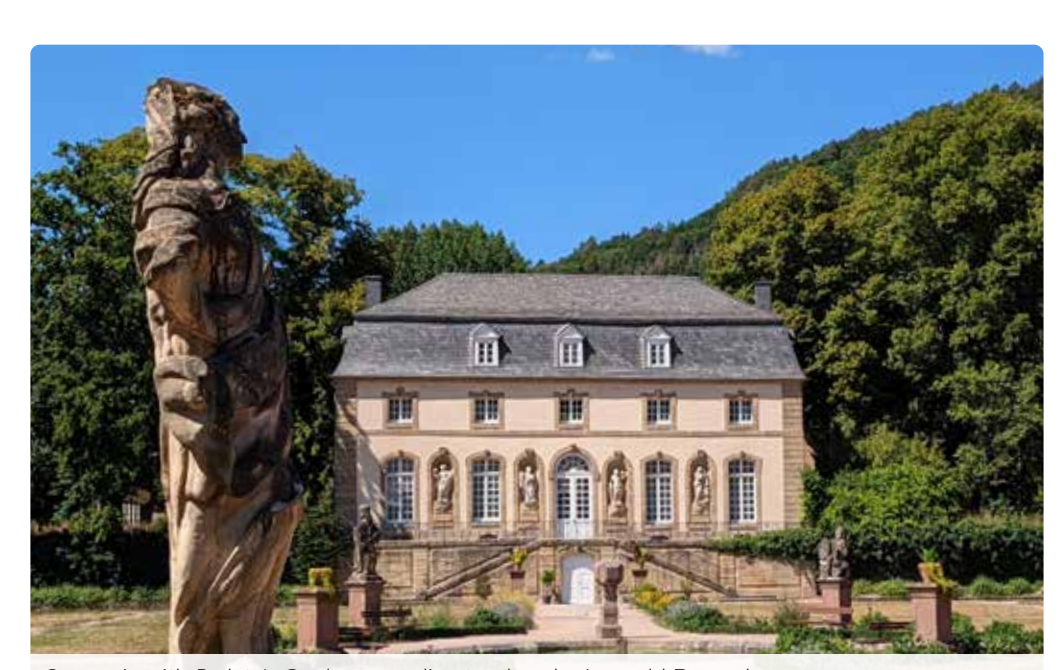
Orangerie with Prelate's Garden according to plans by Leopold Durand

The history of the Natur- & Geopark Mëllerdall begins around 245 million years ago, in a sea. Countless particles of sand and others were deposited and solidified into rock. The sea disappeared, and rivers shaped the impressive rocky landscape of the Mullerthal we see today. The task of the Nature & Geopark is to preserve this heritage and to develop the region in a sustainable way. In 2022 Natur- & Geopark Mëllerdall was included in the international network of UNESCO Global Geoparks .