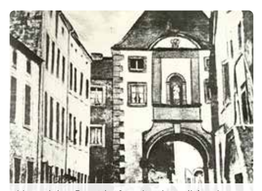
Hooveleker Poart before its demolition in 1867

The area marked with cobblestones in the Rue Hoovelek shows the place where the Hooveleker Poart stood. During archaeolo-