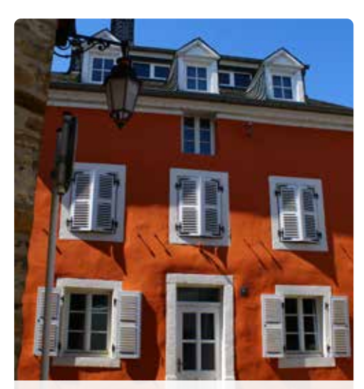
Roud Haous in the Haaler Buurchmauer