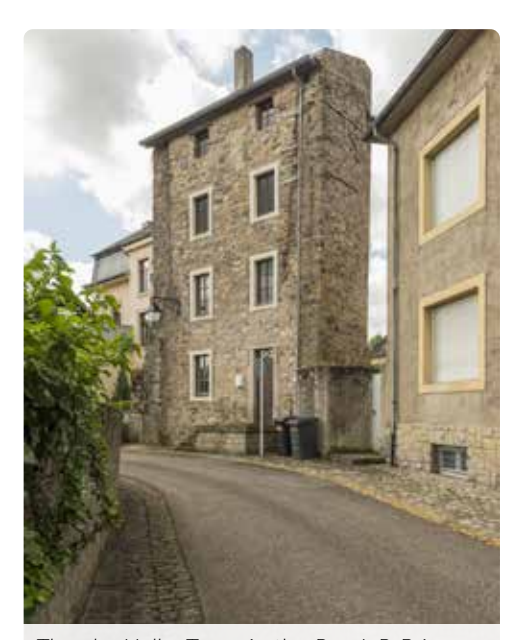
Theodor Holler Tower in the Rue J.-P. Brimmeyr

This residential tower was dedicated to Theodor Holler († 3.12.1734). He was an alderman and later schultheiss (bailiff) of Echternach and represented the town in the Council of States in Luxembourg. As bailiff, he was committed to the restoration of the city walls, towers and streets. A humorous anecdote says that he used the tax levied on wine and other beverages for this purpose. It was joked that the more the people of Echternach drank, the safer and more beautiful their city became!