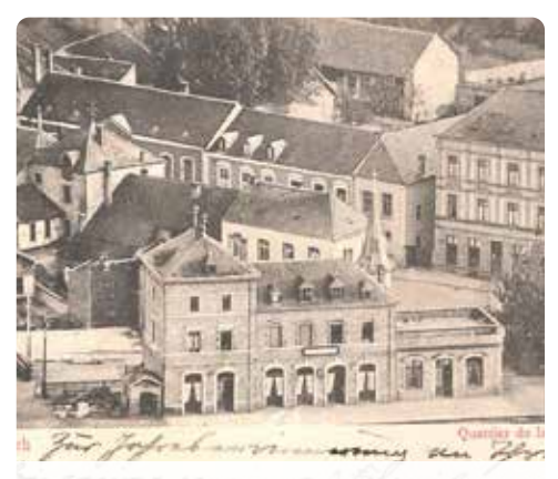
Former railway station building (Postcard 269, Bellwald)

After the Second World War, the narrow-gauge railways were taken over by the CFL (National Company of Luxembourg Railways) and operated until they were discontinued in 1954. They were then replaced by buses. After their closure, the railway lines were partly transformed into cycle paths. The imposing three-part station building with oriel turret was demolished in 1973.