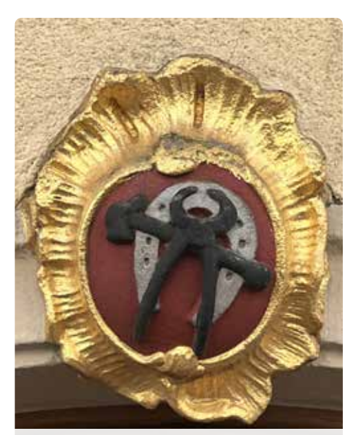
Coat of arms of the blacksmith's guild in the Rue de la Sûre

Cross the Rue des Bons Malades and continue through the narrow Schloff on the opposite side.