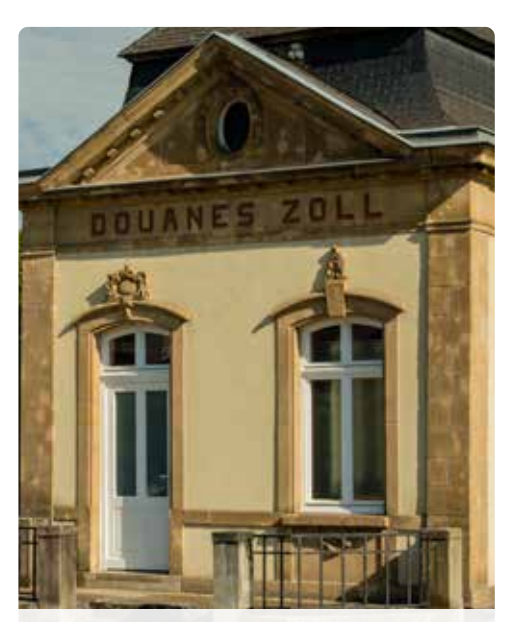
Neo-baroque toll house by the bridge

b TIP: A low barrier path leads from the promenade on the left straight to the pavilion.