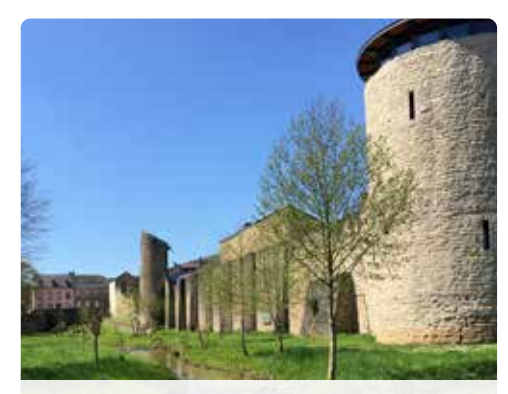
Shanzer Buurchmauer & Lauterburerbaach

The Echternach town moat was fed by the Lauterburerbaach stream. The source of the lively stream is located in the hills above Echternach. It then flows through the city centre into the Sauer. On the plateau, it is fed by many small streams, meaning that it has sufficient water all year round. Thanks to its steep gradient, at least nine mills were able to operate on its riverbanks for over 1.000 years (between the 8th and 20th century). The stream was cut off in front of the city centre near the Luxembourg Gate to allow for the construction of the moat. Part of the stream remained open, flowing through the town centre and into the Sauer, while the other section was diverted to fill the city moat. The water level of the ditch could be regulated with the help of small weirs and sluices. The Lauterburerbaach changes its name several times along its 9.5 km long course. It takes on field names or the names of the respective neighbourhoods along the way. Today, a large portion of the Lauterburerbaach is in canals and several sections of the river run underground.