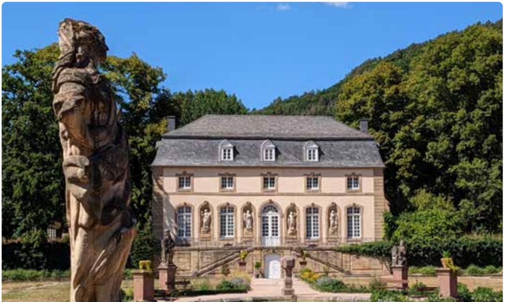
Orangerie with Prelate's Garden according to plans by Leopold Durand

The history of the Natur- & Geopark Möllerdall begins around 245 million years ago, in a sea. Countless particles of sand and others were deposited and solidified into rock. The sea disappeared, and rivers shaped the impressive rocky landscape of the Mullerthal we see today. The task of the Nature- & Geopark is to preserve this heritage and to develop the region in a sustainable way. In 2022 Natur- & Geopark Möllerdall was included in the international network of UNESCO Global Geoparks .