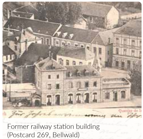
Former railway station building (Postcard 269, Bellwald)

After the Second World War, the narrow-gauge railways were taken over by the CFL (National Company of Luxembourg Railways) and operated until they were discontinued in 1954. They were then replaced by buses. After their closure, the railway lines were partly transformed into cycle paths. The imposing three-part station building with oriel turret was demolished in 1973.