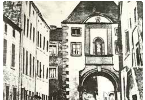
Hooveleker Poart before its demolition in 1867

The area marked with cobblestones in the Rue Hoovelek shows the place where the Hooveleker Poart stood. During archaeolo-