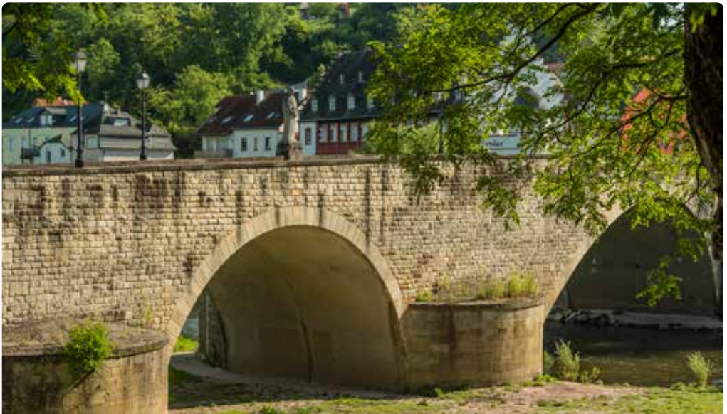
Border bridge over the Sauer between Luxembourg & Germany