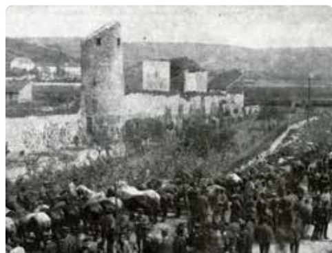
Regional horse market at the Trier Gate

For many years, an important regional horse market was held on the square next to the Trier Gate .