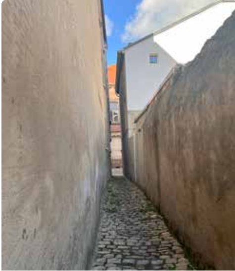
Typical Schloff - Kellereigank

b TIP: You can also reach the next point, Rue de la Sûre , via the low barrier path that runs straight ahead from Wollefstuerm through Rue des Redoutes .