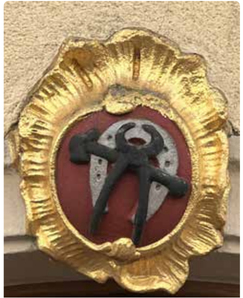
Coat of arms of the blacksmith's guild in the Rue de la Sûre

Cross the Rue des Bons Malades and continue through the narrow Schloff on the opposite side.