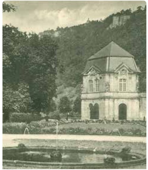
Rococo pavilion & limestone tuff fountain

sources that ran through the gardens of Echternach's former monastery during the abbey period. The stone in the middle is a limestone tuff, the youngest solid rock in the Müllerthal region. In the surrounding sandstone, the lime is dissolved, which forms the binding agent between the quartz grains. If this lime-rich water comes to the surface from a source, solid lime can form again through evaporation of the water and other processes. The calcareous water that spouts from the stone means that the stone continues to grow to this day. The moss that has settled on the stone is called curled hook-moss . It grows in calcareous and moist locations and likes to colonise soil, rock and rotten wood.