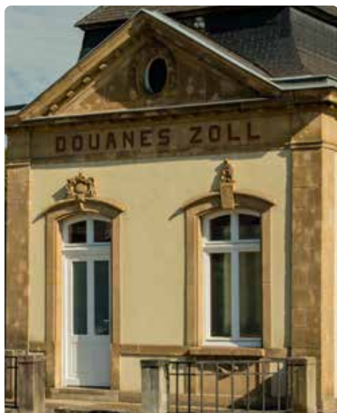
Neo-baroque toll house by the bridge

b TIP: A low barrier path leads from the promenade on the left straight to the pavilion.