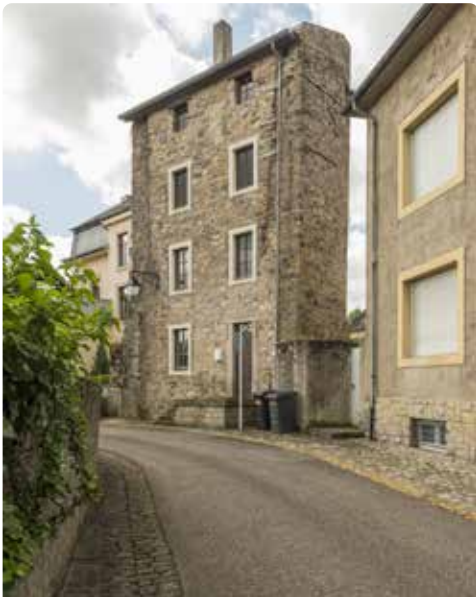
Theodor Holler Tower in the Rue J.-P. Brimmeyr

This residential tower was dedicated to Theodor Holler († 3.12.1734). He was an alderman and later schultheiss (bailiff) of Echternach and represented the town in the Council of States in Luxembourg. As bailiff, he was committed to the restoration of the city walls, towers and streets. A humorous anecdote says that he used the tax levied on wine and other beverages for this purpose. It was joked that the more the people of Echternach drank, the safer and more beautiful their city became!