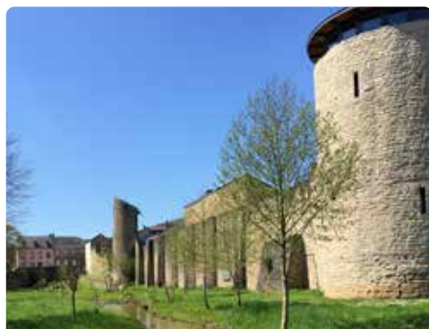
Shanzer Buurchmauer & Lauterburerbaach

The Echternach town moat was fed by the Lauterburerbaach stream. The source of the lively stream is located in the hills above Echternach. It then flows through the city centre into the Sauer. On the plateau, it is fed by many small streams, meaning that it has sufficient water all year round. Thanks to its steep gradient, at least nine mills were able to operate on its riverbanks for over 1,000 years (between the 8 th and 20 th century). The stream was cut off in front of the city centre near the Luxembourg Gate to allow for the construction of the moat. Part of the stream remained open, flowing through the town centre and into the Sauer, while the other section was diverted to fill the city moat. The water level of the ditch could be regulated with the help of small weirs and sluices. The Lauterburerbaach changes its name several times along its 9.5 km long course. It takes on field names or the names of the respective neighbourhoods along the way. Today, a large portion of the Lauterburerbaach is in canals and several sections of the river run underground.