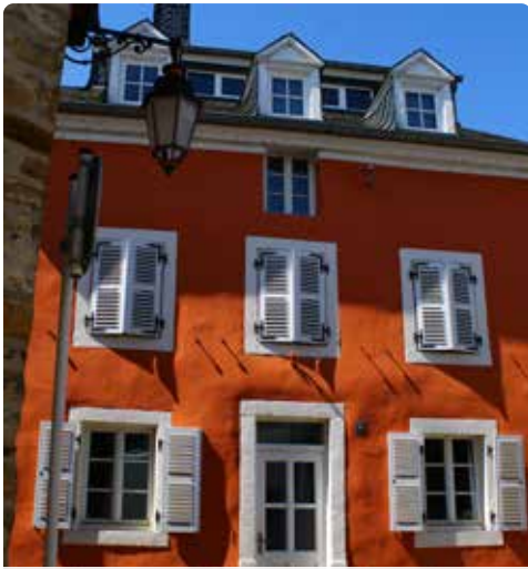
Roud Haous in the Haaler Buurchmauer